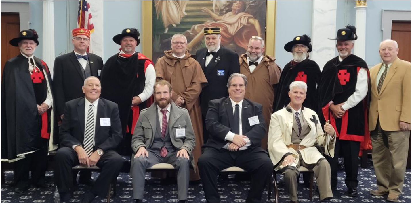
Members of the Valley of Cumberland Fall 2022 Class pictured with the 30 th Degree Cast and Crew