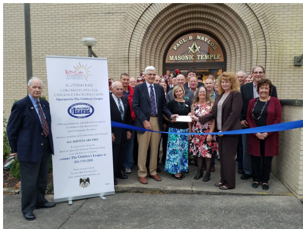
Ribbon Cutting of the New Rite Care Clinic At Oakland Lodge No. 192. We Already Have Many Clients Using Our New Clinic Location

Since the Cumberland Rite Care Clinic opened in 1997, the Cumberland Scottish Rite Foundation has contributed more than $265,000 to support free diagnostic evaluation and treatment of speech and language disorders to equip children in our community with the ability and skills to lead productive lives. This clinic has directly benefited and improved the lives of more than 1500 children in Western Maryland and the surrounding region.